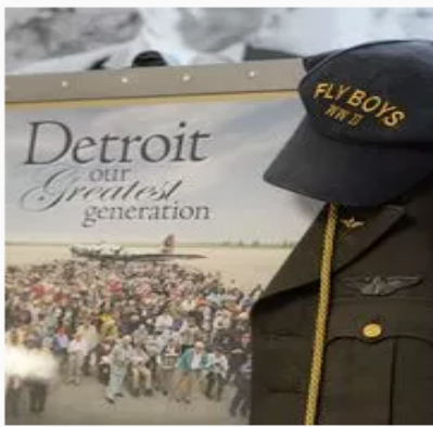
A display of World War II memorabilia from the documentary "Detroit the Greatest Generation," includes his dad's "Fly Boys" cap and other items.

"When my dad died, I made a conscious decision to make a documentary on Alzheimer's ... as we did the series on aging ... It was only a matter of time," he said.